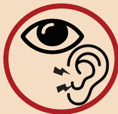
Ear or eye infection